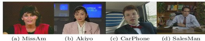
Figure 5: The embedded I frames of test videos