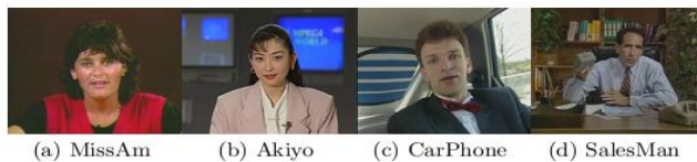
Figure 4: The four original I frames of various test videos